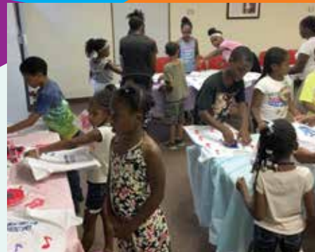
Using stencils and paint, children created their own 'rocking' t-shirts at the Muskegon Heights Branch.