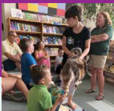
DNR naturalist from Hoffmaster State Park visited Montague children and talked about fur bearing animals in Michigan.