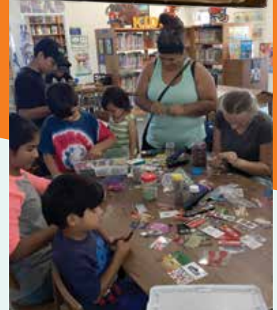
Children and moms enjoyed a 'Make It @ MADL: Guitar Pick Fun' and learned how to make a necklace, zipper pull or keychain at the Montague Branch Library.

Hundreds of children, family members, teens and adults enjoyed a full line-up of weekly summer programs. In addition to our 'Libraries Rock' Summer Reading program, many entertaining and educational programs were held during our busiest time of the year.