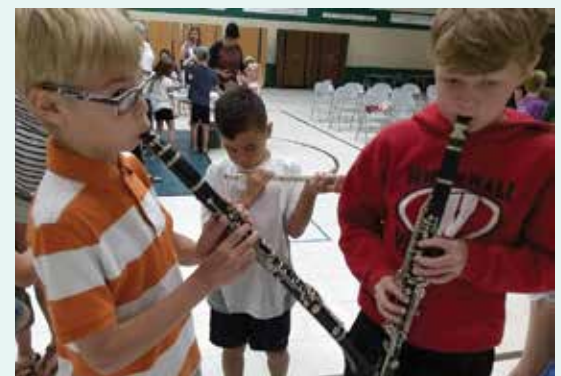
New this year, MADL partnered with the West Michigan Symphony and offered an instrument petting zoo. This hands-on musical instrument education program brought brass, string, woodwind and percussion alive and encouraged youngsters to try their musical abilities.

The Summer Reading program encourages children, youth and families to read, helps children maintain their reading skills and also helps foster a love of reading. Access to books and library programs during the summer results in more reading and improved reading skills for continued lifelong learning.